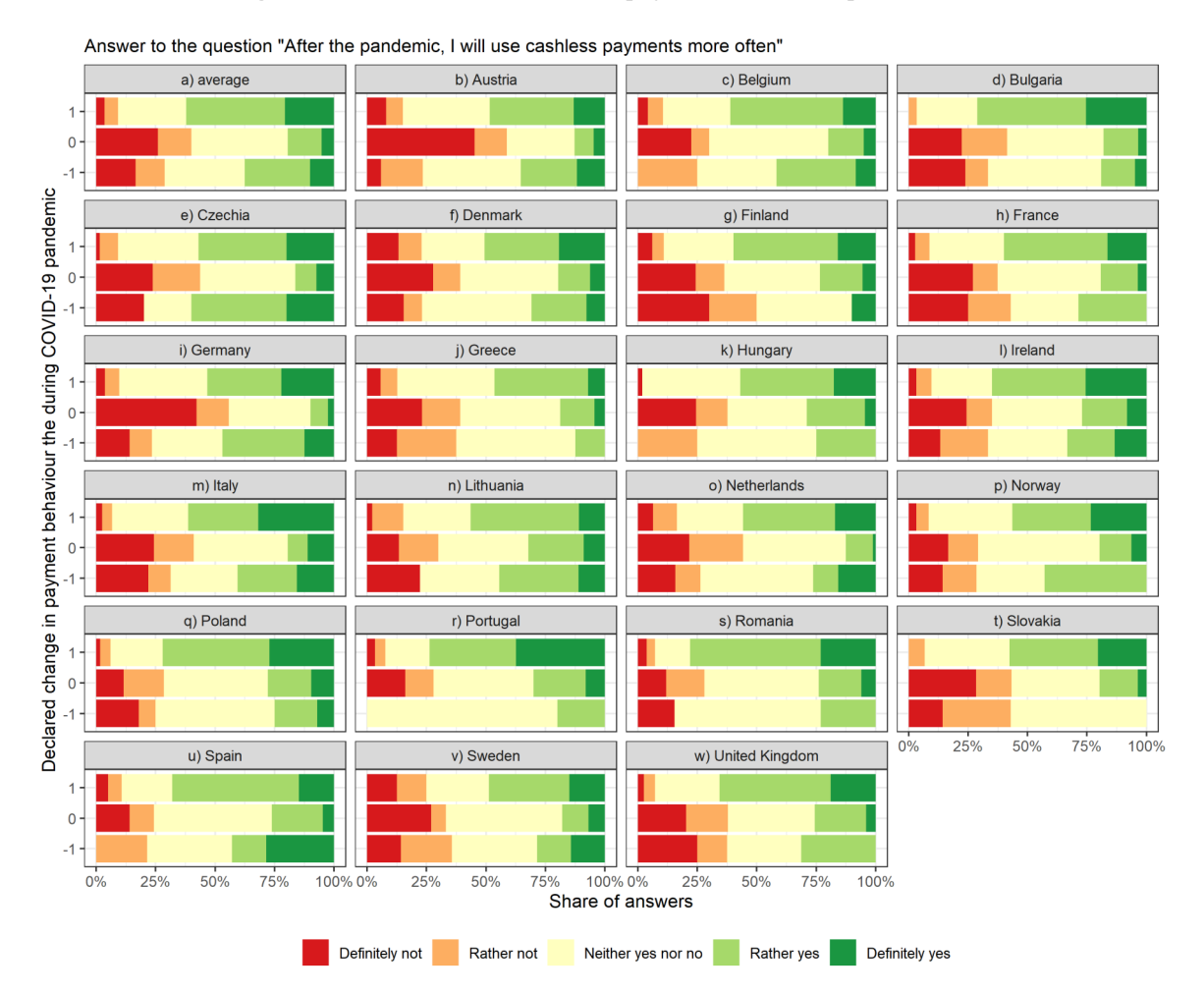
Figure 2. Intention to use cashless payments after the pandemic

Generally, 41.5% of respondents stated that they would 'rather yes' or 'definitely yes' intend to use more cashless payments; on the contrary 24.2% were 'definitely no' or 'rather no', with 34.3% undecided. However, there are stark differences when payment behaviour change during the pandemic is taken into account: 62.3% of respondents that had changed their behaviour towards cashless payments (bearing in mind that almost half of respondents acted this way) stated that they were on the 'yes' side of our diverging scale, while only 9.2% said 'no'. People that had not changed their payment behaviour were also unsure about future payment preferences (40.6%) or had a negative attitude towards the idea (39.9%). Surprisingly, people that changed their behaviour towards more cash payments during the pandemic often said that they intended to make more cashless payments in the future (37.6% versus 28.7% who opposed the idea). This may suggest, that the pandemic was causing some consumers to behave against their normal preferences, and in the long term they expected to correct this situation.