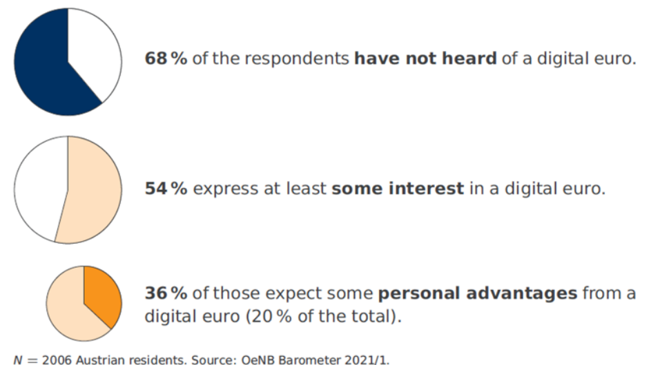
Figure 1: Respondents' awareness and interest in a digital euro