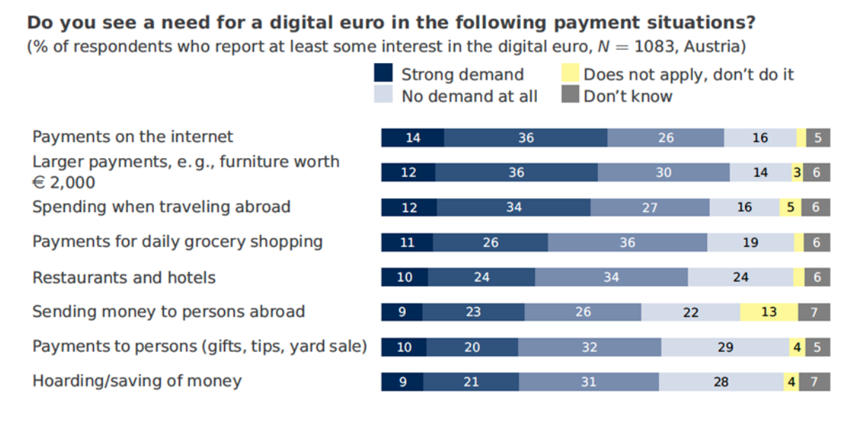
Figure 2: Need for a digital euro in selected transaction types

When investigating for which transaction types potential users see a specific need for a digital euro (see Figure 2), the overall picture we obtain is that the need for a digital euro is not pronounced in any transaction type included in the study. Instead, respondents show a high level of satisfaction with the existing payment options. This indicates that at present there is no pressure from users on the central bank to provide a digital euro soon.