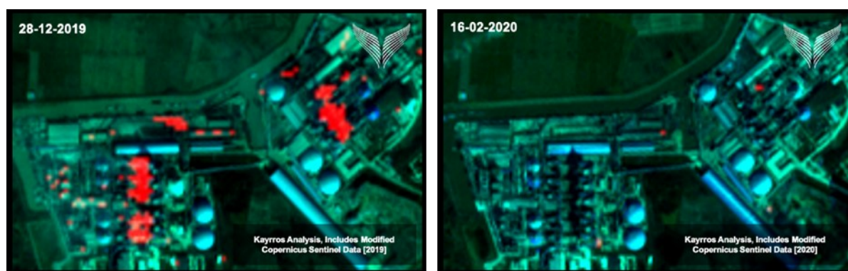
Chart 1: Satellite image of a cement plant in China (Before/During Covid-19)

Note: The pixels colored in red are those for which the algorithm detects the heat of the cement kilns.