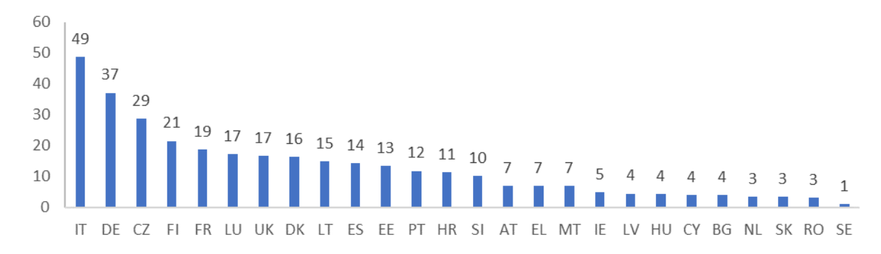
Figure 4. Total size of expected fiscal response (% of GDP)

Notes: Other category includes measures with retroactive effect, in negotiation and those undefined.