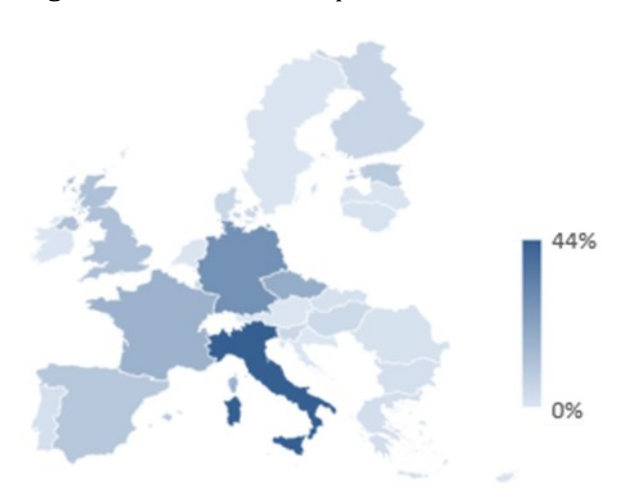
Figure 6. Indirect Fiscal impact of COVID related measures (% of GDP)

Almost all countries implemented guarantees . The scale of this measure is largest among all categories of fiscal measures, with 6.3% of GDP on average (see Figure 6). The largest public guarantees were introduced in Italy, Germany, Czech Republic, France and Spain.